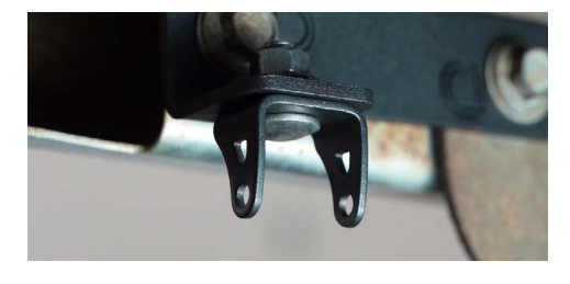
3. Install the universal pod bracket onto the reverse light bracket using the provided hardware. Make sure that the curved portion of the bracket is facing towards the rear of the vehicle.