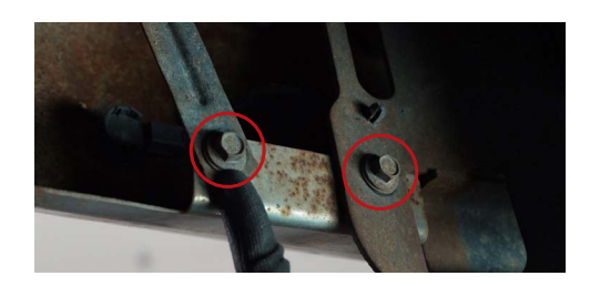
1. Using a 13mm socket and ratchet, remove the factory bolts shown in the picture above on the underside of the truck bumper.

If you don't plan on using the override function, you may want to leave the switch in the "1" position, and leave it in the engine bay.