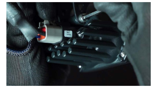
15. Aim the pods as desired. Then tighten down the hardware using a 5/32" allen-key and a 3/8" wrench. Aiming can be achieved with the pods installed on the vehicle. There is no need to remove the pods to re-aim.