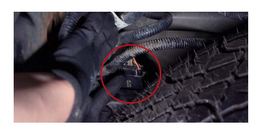
5. Locate the black 16-pin Molex (Type A) connector under the truck bed near the spare tire.

Repeat these steps on the other side of the vehicle.