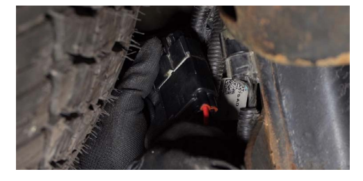
8. Connect the provided vehicle-specific adapter harness in-line.