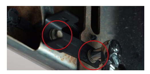
2. Install your new reverse light bracket onto the vehicle using the factory bolts removed in the previous step.