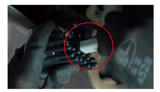
14. Plug the DT connector into the back of the pods ① and the amp connector into the vehicle-specific adapter harness ⑤.

Please contact Diode Dynamics should you have any questions about the installation or wiring process, at 314-205-3033 (10a-5p CST) or contact@diodedynamics.com .