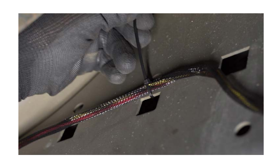
13. Route the connector end of the harness down underneath the vehicle however you see best fit. For this application, we recommend following the wheel well underneath, making sure to avoid any hot or moving parts.

NOTE: Disconnect the universal section from the amp connector on the provided universal wiring harness, this section will not be used.